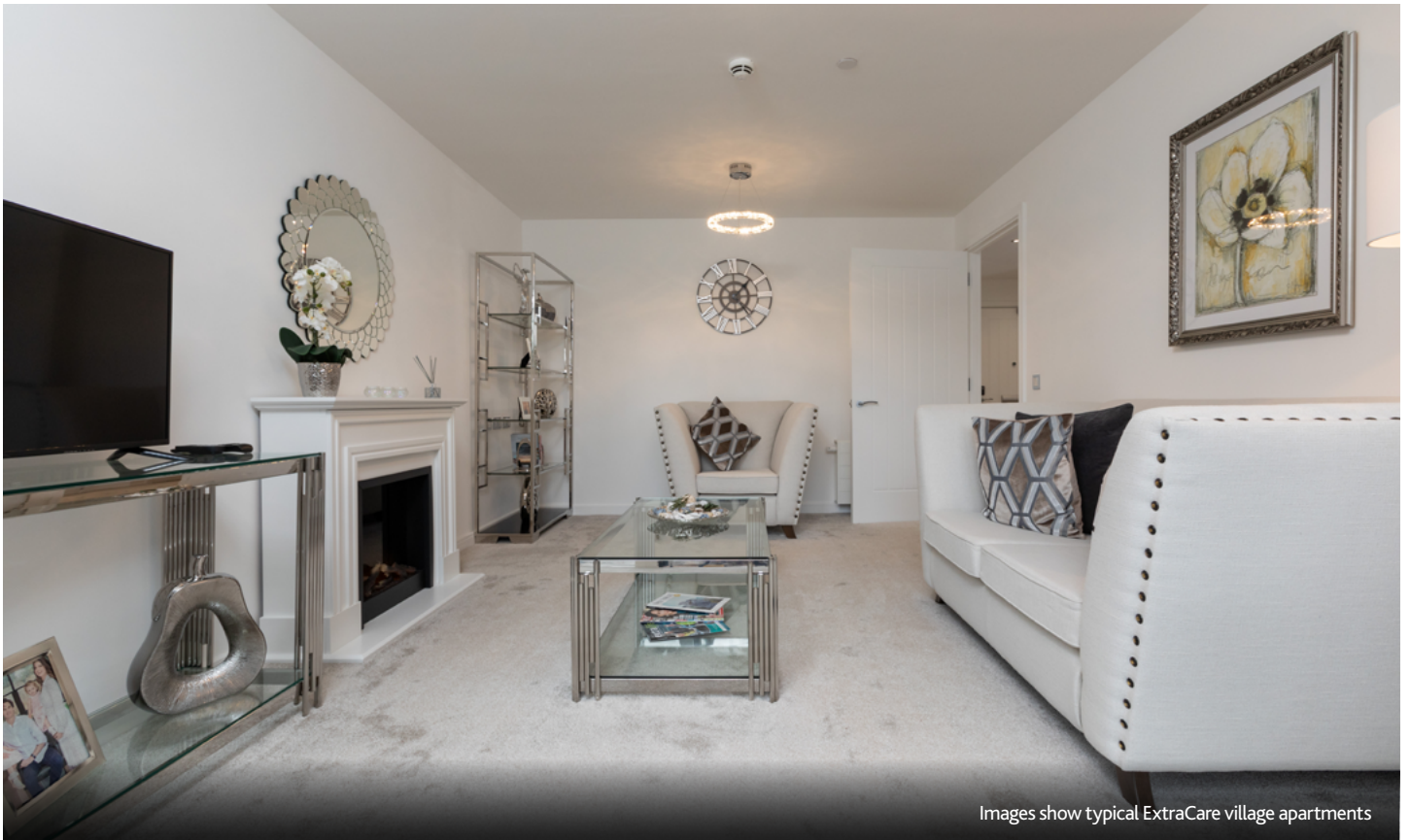
Images show typical ExtraCare village apartments